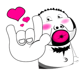
Donuts, man! 12<sup>th</sup> 4-0

\begin{array}{c} Pizza \ \pi \\ \text{(always delivering)} \\ 7^{th} \ 4-0 \end{array}